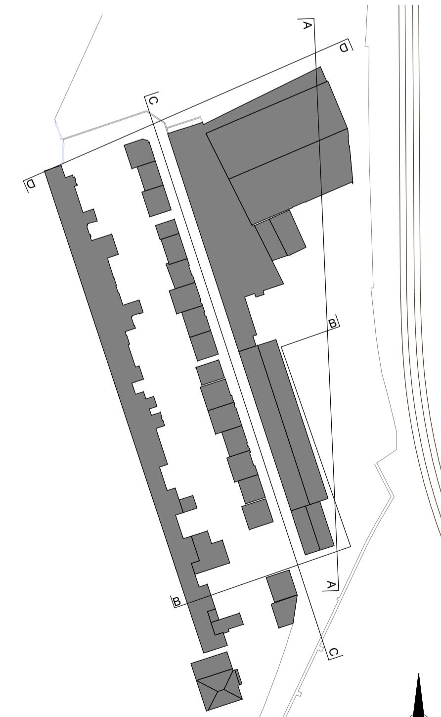
Key Plan - not to scale