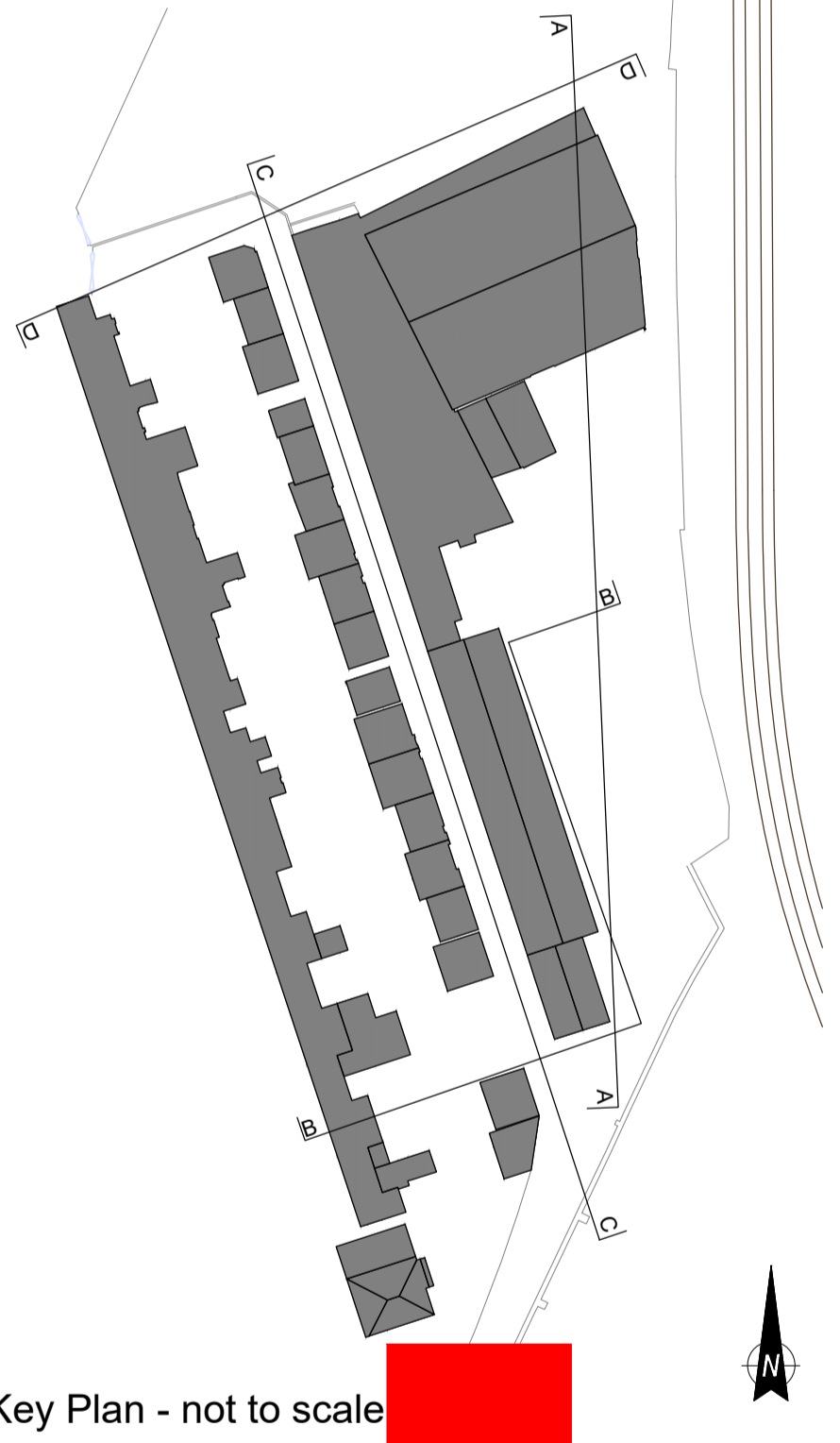
Key Plan - not to scale

JOHN FLEMING ARCHITECTS 103 LEESON STREET UPPER, DUBLIN 4. T: (01) 6689888 E: info@jfa.ie W: www.jfa.ie